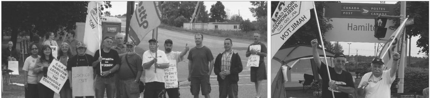
Members of Local 1005 at CUPW picket line at the Stoney Creek sorting station, June 20, 2011

“We sincerely appreciate your fighting stand.”