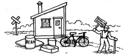
Ten Years Later

Consumer prices rose 3.7% in the 12 months to May, Statistics Canada reports. This is the largest increase since March 2003. This follows a 3.3% increase posted in April. While most of this increase is attributed to rising energy costs, excluding gasoline, the Consumer Price Index (CPI) rose 2.4% in the 12 months to May, following a 2.2% rise in April.