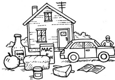
The Reality for Some