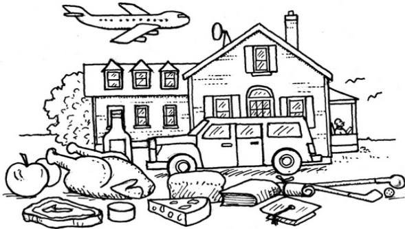
The Alleged Dream

Consumer prices continue to rise, Statistics Canada reports