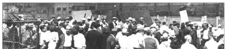
The historic strike of 1946.